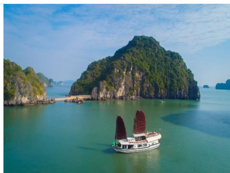
Overview of Junk