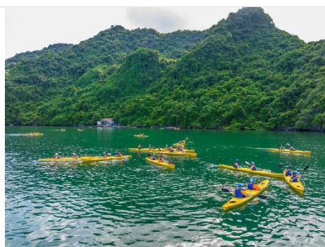
Kayak at Tra Bau Area