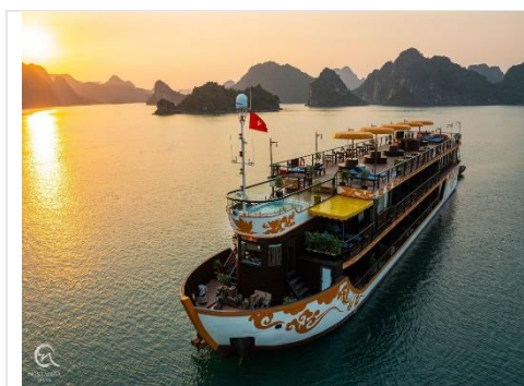
Overview of Cruise