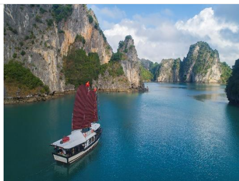
Overview of Cruise