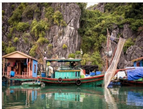
Vung Vieng Fishing Village