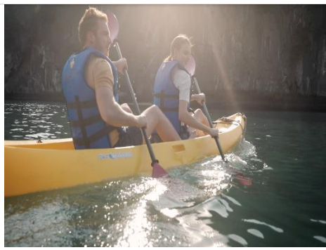
Kayaking on Lan Ha Bay