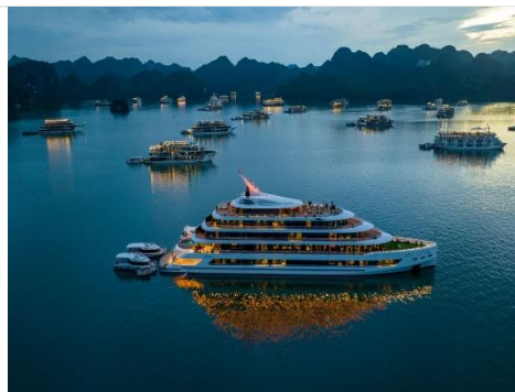
Overview of Cruise