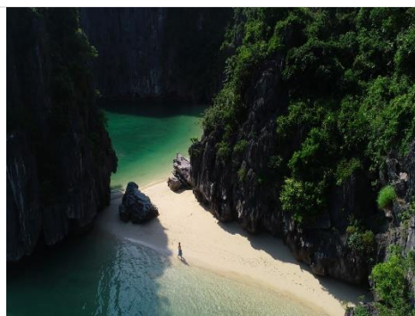
Lan Ha Beach