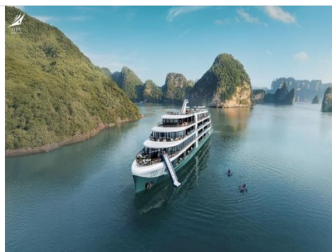
Overview of Cruise