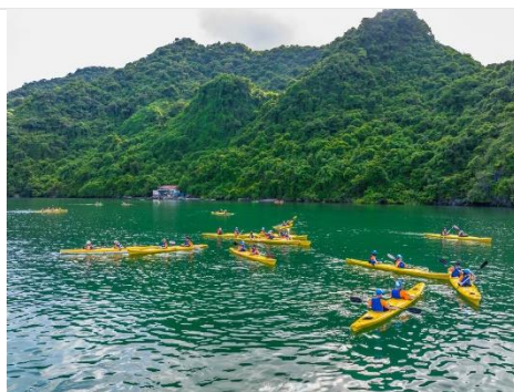
Kayaking on Lan Ha Bay