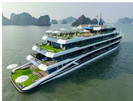
Overview of Cruise