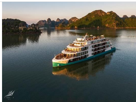
Overview of Cruise