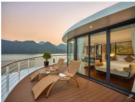
Sundeck of Owner Suite