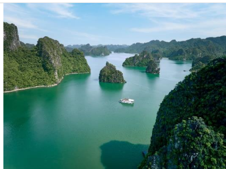
Bai Tu Long Bay